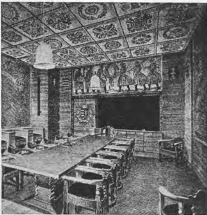
HUNGARIAN ROOM IN CATHEDRAL OF LEARNING, UNIVERSITY OF PITTSBURGH