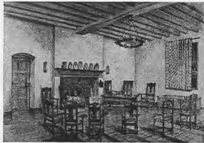
PENNSYLVANIA DUTCH ROOM IN CATHEDRAL OF LEARNING, UNIVERSITY OF PITTSBURGH

Their Formal May Annual Dance held on May 8 and a second semester initiation completed \Psi\Sigma 's social calendar of the year. These affairs rounded up a very active year socially. By the way, they wish to acknowledge the appreciated support that \text{RHO} chapter (Tech) gives them and which they reciprocate.